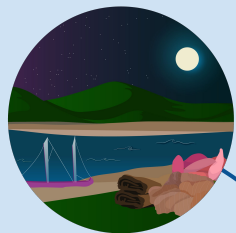
Whakariterite Preparation of Crew.