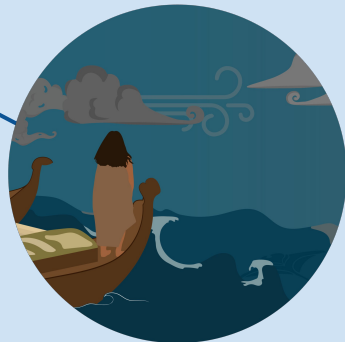
Te Whāinga Digging deeper, researching, exploring tohu.