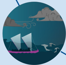
Te Rapunga Venturing into the unknown.