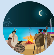
Te Rawenga Celebrate, reflect, acknowledge tohu.