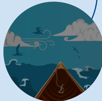
Te Kitenga Sighting tohu to project you forward.