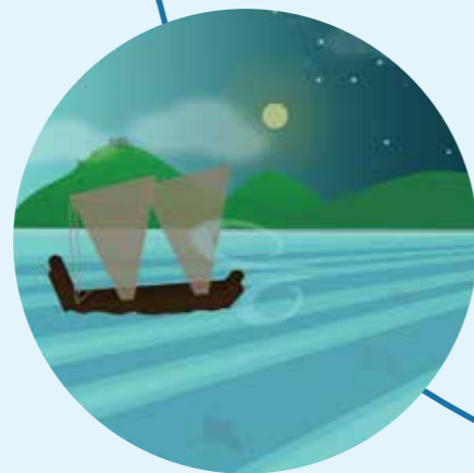
Te Rapunga Venturing into the unknown.