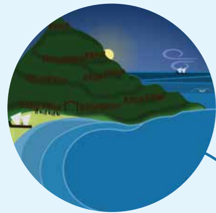
Whakariterite Preparation of Crew.