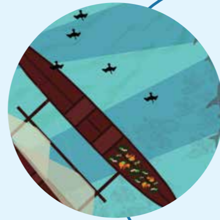
Te Whāinga Digging deeper, researching, exploring tohu.